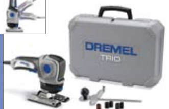
Circle cutter shown but not included available below!